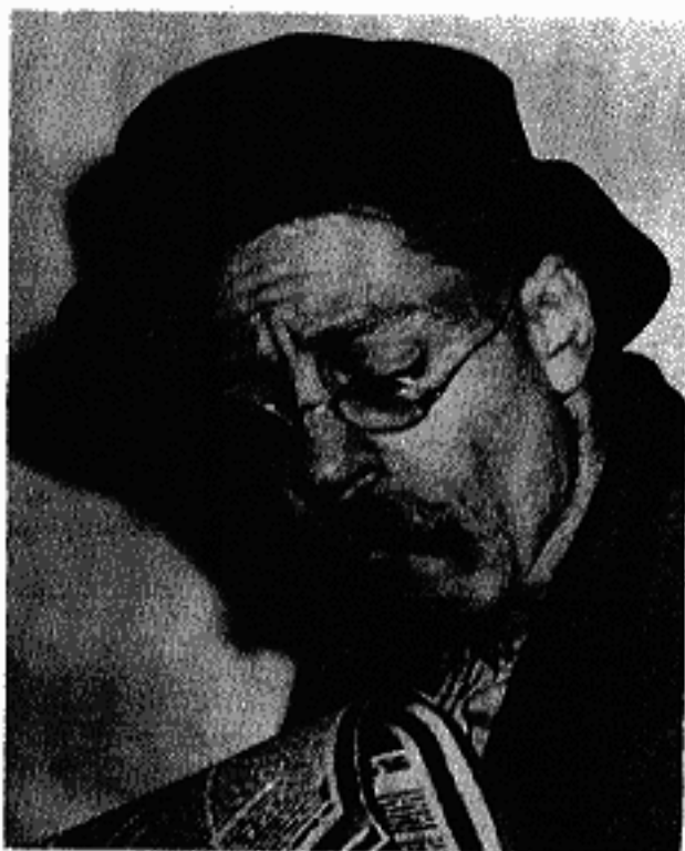
Four close-ups showing how completely different effects can be produced by changes in make-up and props. (See also page 5.)